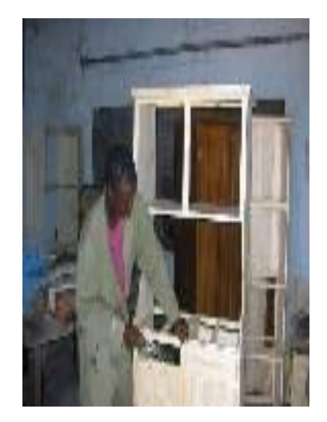
Objective: The objective of the week lecture is for the students to be able to explain the importance of Technical and Vocational Education, the introduction