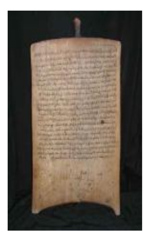
Week 7: Arabic and Islamic Education in Nigeria